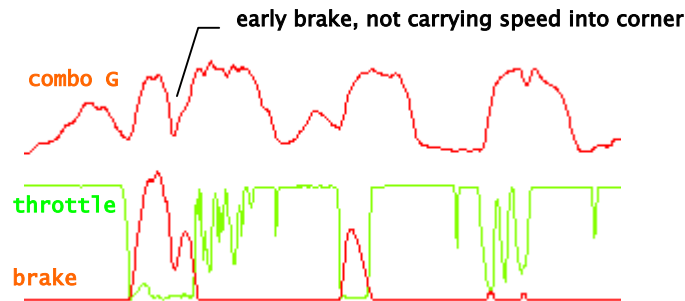
Figure 3 - 'Early brake' signature

In a straight-line braking area, the braking G figure should be able to reach the same level as the steady-state cornering G. Check for a step in the combo G channel to find where the driver is not pressing the brakes hard enough.