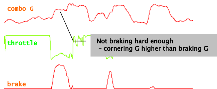
Figure 4 - 'Weak brake' signature

In a straight-line braking area, the braking G figure should be able to reach the same level as the steady-state cornering G. Check for a step in the combo G channel to find where the driver is not pressing the brakes hard enough.